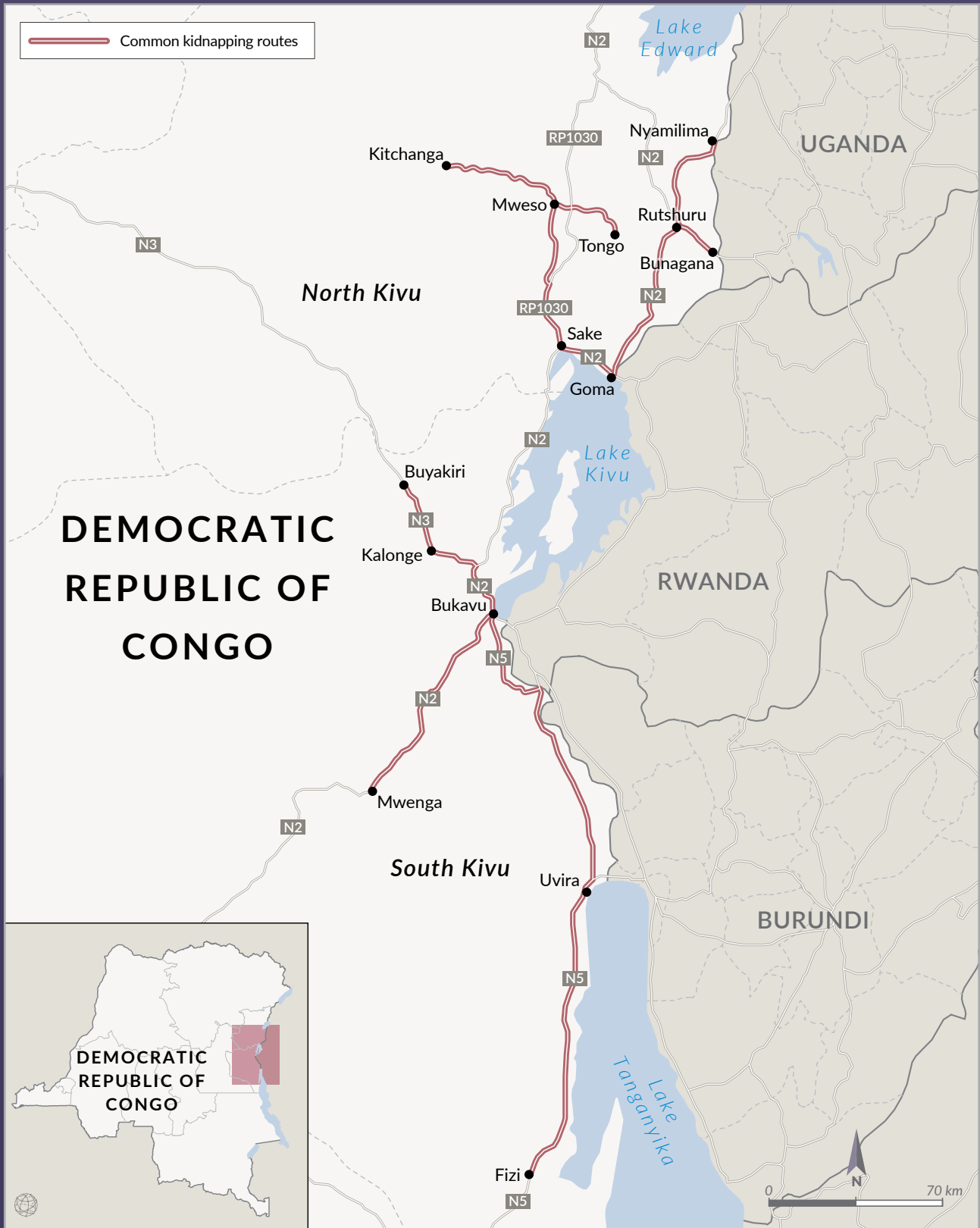
FIGURE 1 Common kidnapping routes in North and South Kivu provinces, DRC.