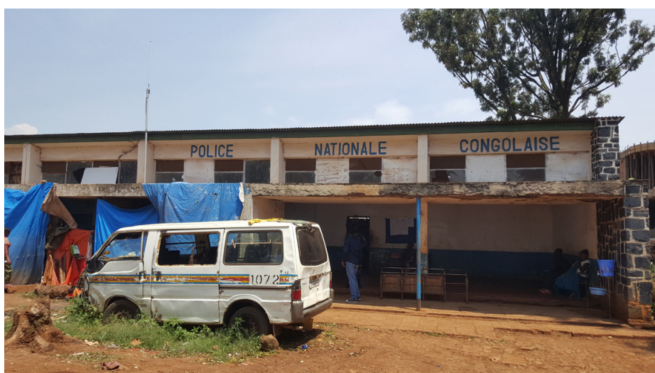
The police station in Bukavu, South Kivu. Lack of resources hampers the police response to kidnappings in eastern DRC.

On 3 May 2021, the president declared a state of emergency in the provinces of Ituri and North Kivu to 'contain these serious threats and secure the population and their property'. 45 The civilian authorities were replaced by the military authorities. Initially planned for one month, the state of emergency was extended and is still in force as of May 2023. However, the state of emergency has not reduced crime in general or kidnappings in particular in North Kivu. 46 In South Kivu, in 2022, due to the absence of response from the militaries deployed in the Hauts-Plateaux, the armed group Yakutumba substituted the authorities and fought against kidnappers. 47