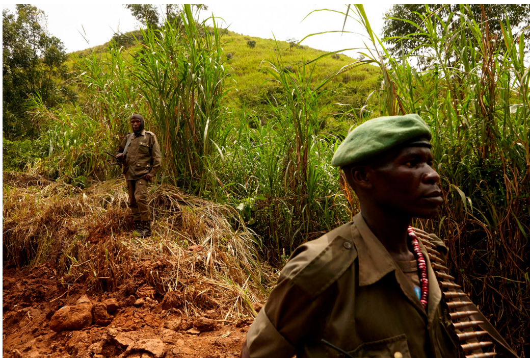
Congolese soldiers patrol the road linking the towns of Kibirizi and Bwito in Rutshuru territory, North Kivu. Rutshuru has become a hotspot for kidnappings and recruitment of rebel soldiers within the region.