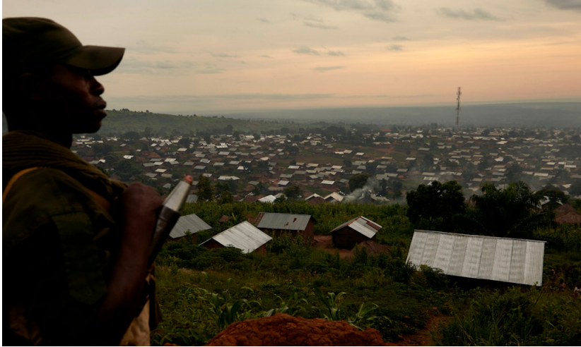
The kidnapping business reveals the close-knit relationship between the security forces and the forces driving insecurity in North and South Kivu.

are often not full-time kidnapers: they participate in legal and illegal activities and form armed bands or gangs that are relatively short-lived (as evident in the seasonal nature of kidnappings). The social expansion of brigandage is a symptom of a growing part of the population turning to opportunistic crime as a survival strategy. This criminalization of society leads to trivialization and an increase in violence, creating a vicious cycle over time: poverty leads to the criminalization of society, which leads to an increase in violence, leading to more poverty.